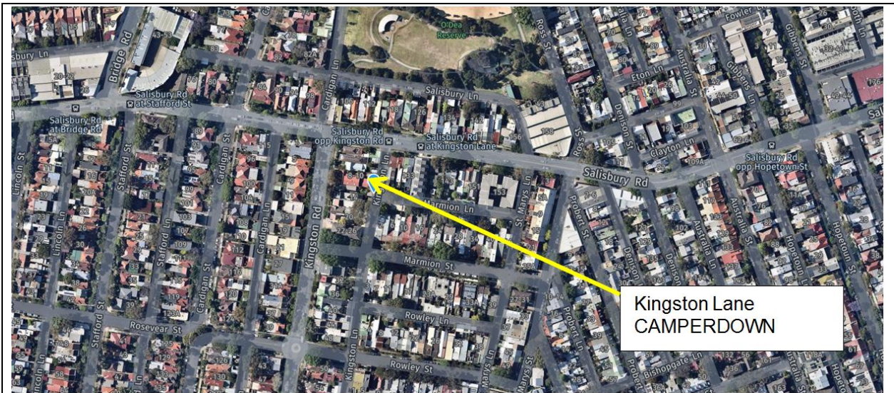
Locality map – Kingston Lane, Camperdown

At present, ‘No Parking’ restrictions are installed along the eastern side of the subject section of Kingston Lane and unrestricted parking is permitted along the western side of the subject section of Kingston Lane (refer to the attached locality map).