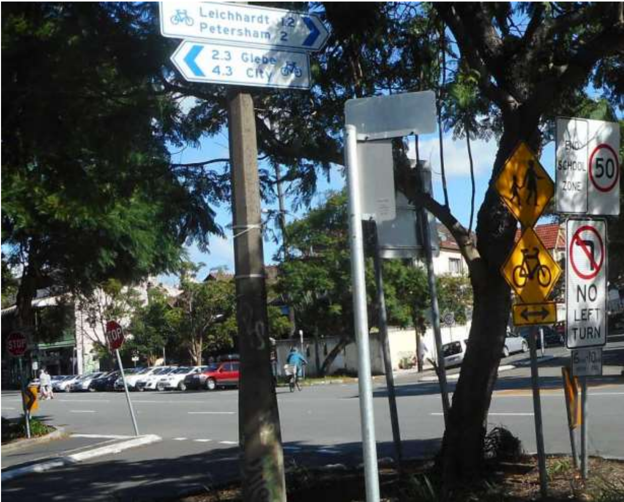
Elderly Pedestrian and Cyclist crossing Johnston Street, Annandale on 1 May 2020