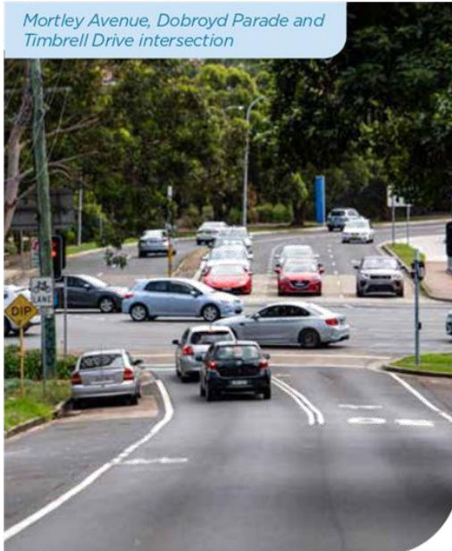
Mortley Avenue, Dobroyd Parade and Timbrell Drive intersection

Transport for NSW is planning improvements to the road network in the Haberfield, Ashfield and Leichhardt area to make travel to and around the area easier and safer for motorists, cyclists and pedestrians. These proposed changes will help to relieve congestion around some key intersections and improve traffic flow and pedestrian connections between suburbs.