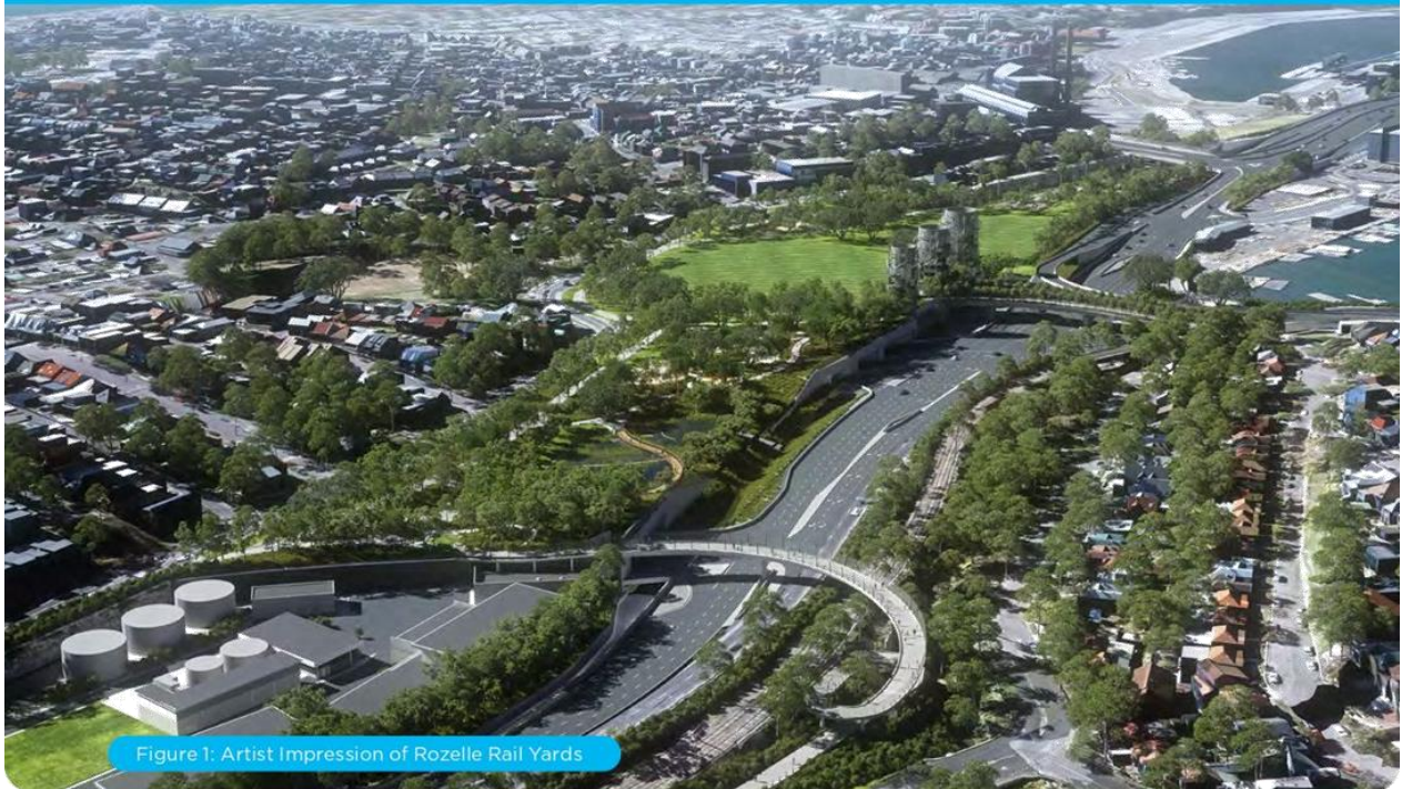
Figure 1: Artist Impression of Rozelle Rail Yards

Our objective for the Rozelle Interchange Project is to restore a vibrant and healthy landscape throughout Rozelle and create a destination city park for all the community to enjoy. The Project will enhance the Victoria Road corridor at Iron Cove and make a significant contribution to the liveability and greening of this part of The Bays Precinct.