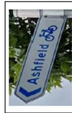
bicycle wayfinding sign to ASHFIELD