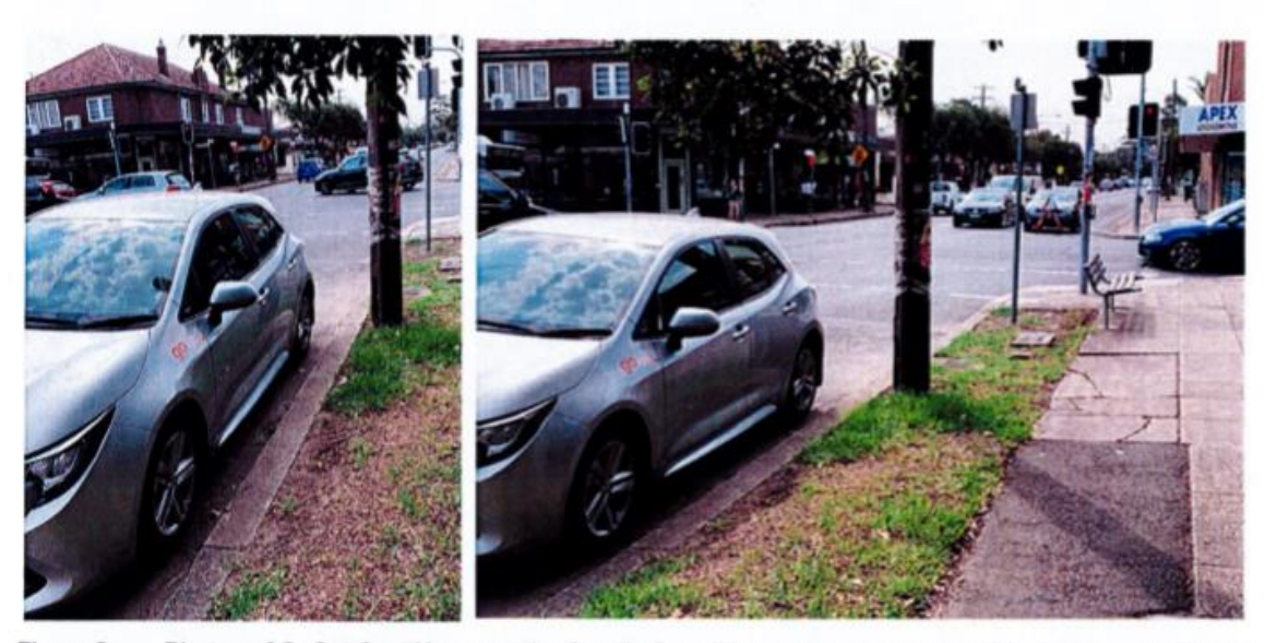
Figure 2 Photos of GoGet Car "Manpreet the Corolla Sport" located on the corner of Sydenham and Victoria Roads