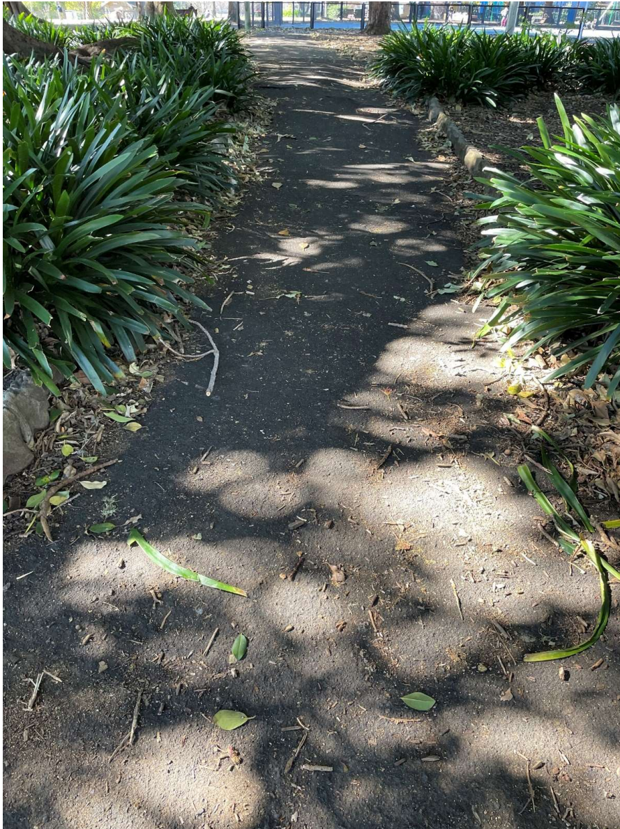
Centre AC footpath