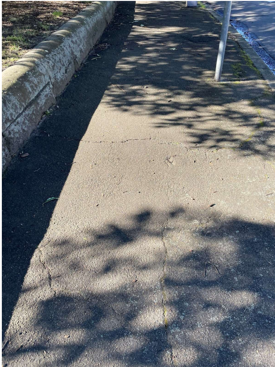
Darvall St (5)