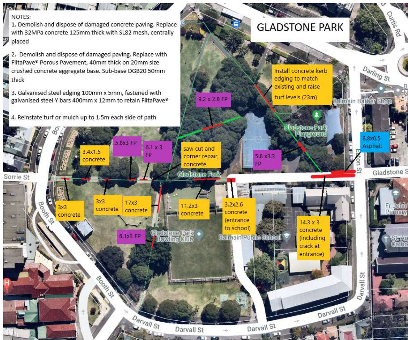
Park Footpaths Detailed Scope