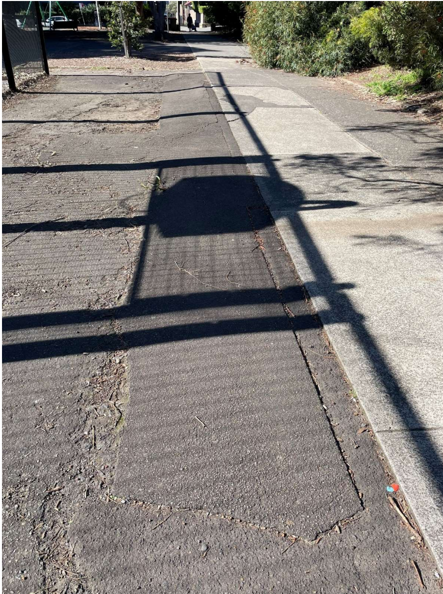
AC and concrete interface