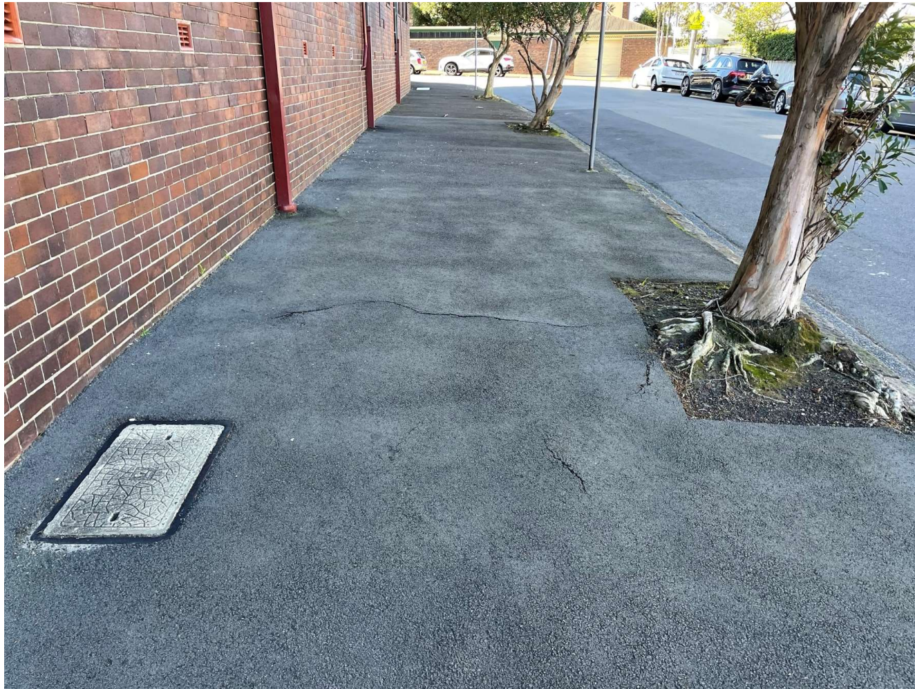
Darvall Street (3)