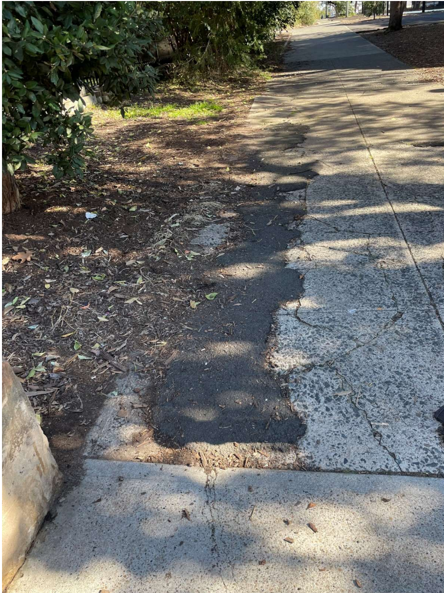
Darvall Street Concrete Footpath (1)