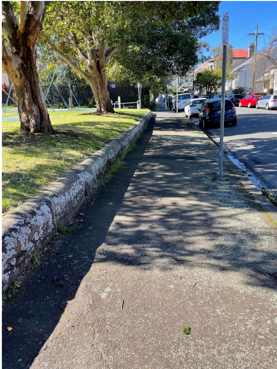
Darvall Street (2)