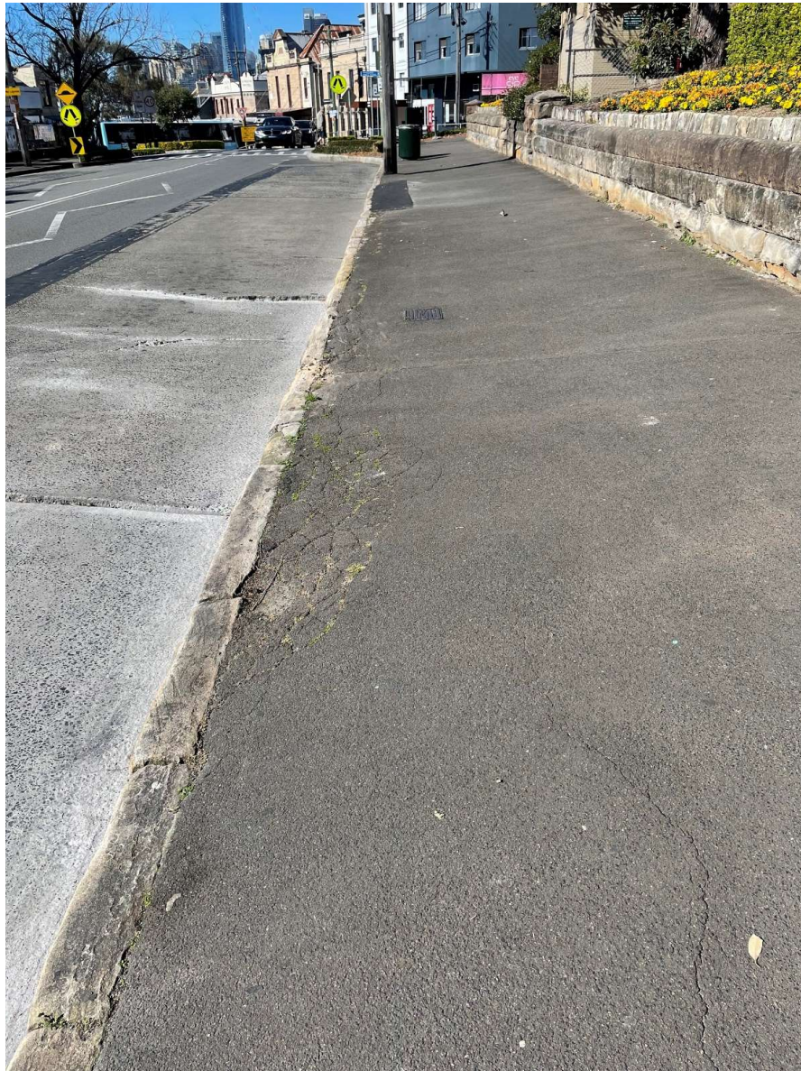
Darling Street (1)