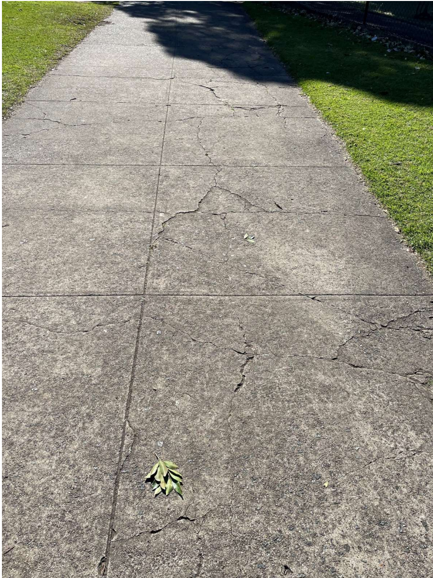
Darvall Street (4)