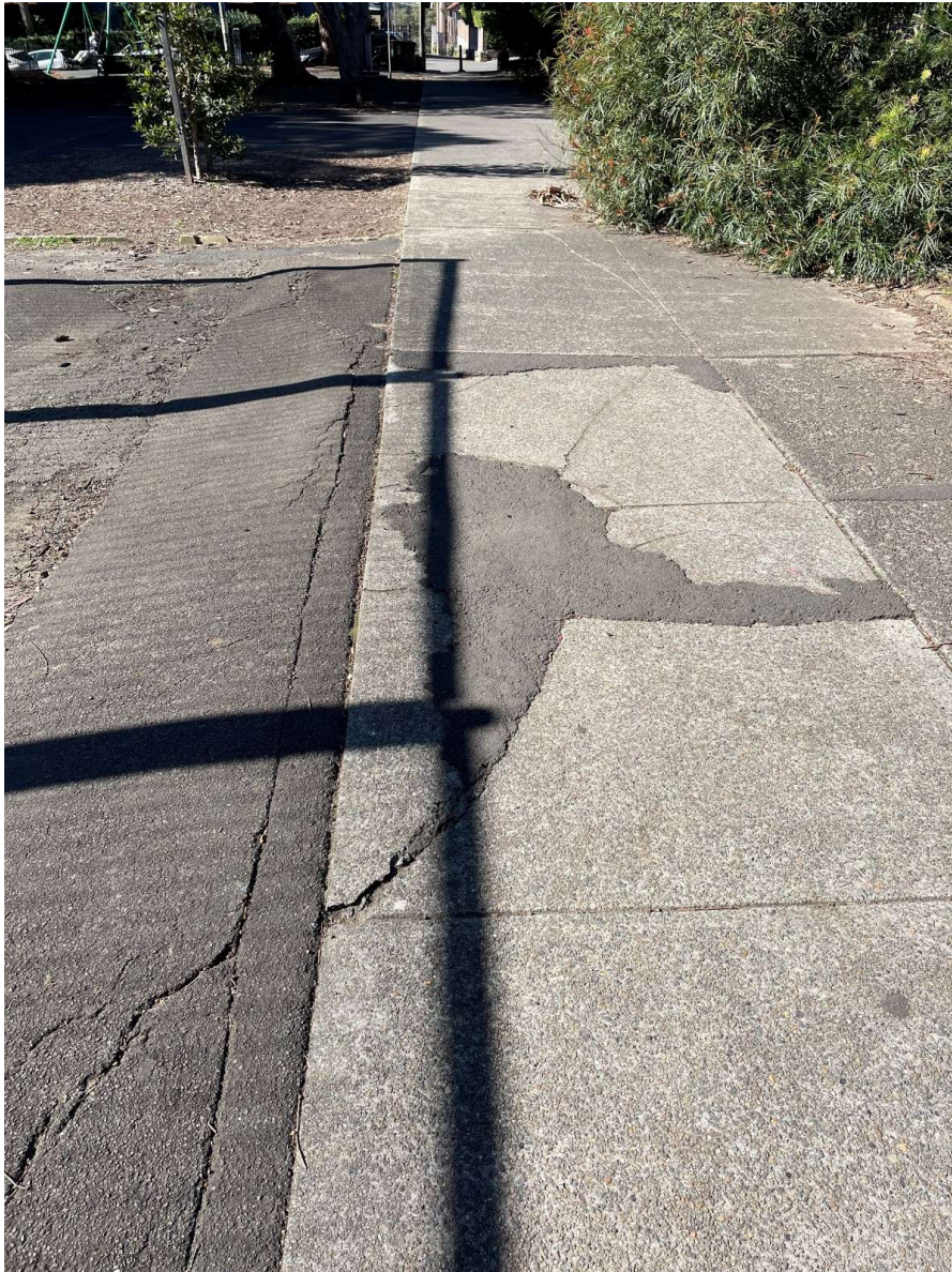
AC and concrete interface