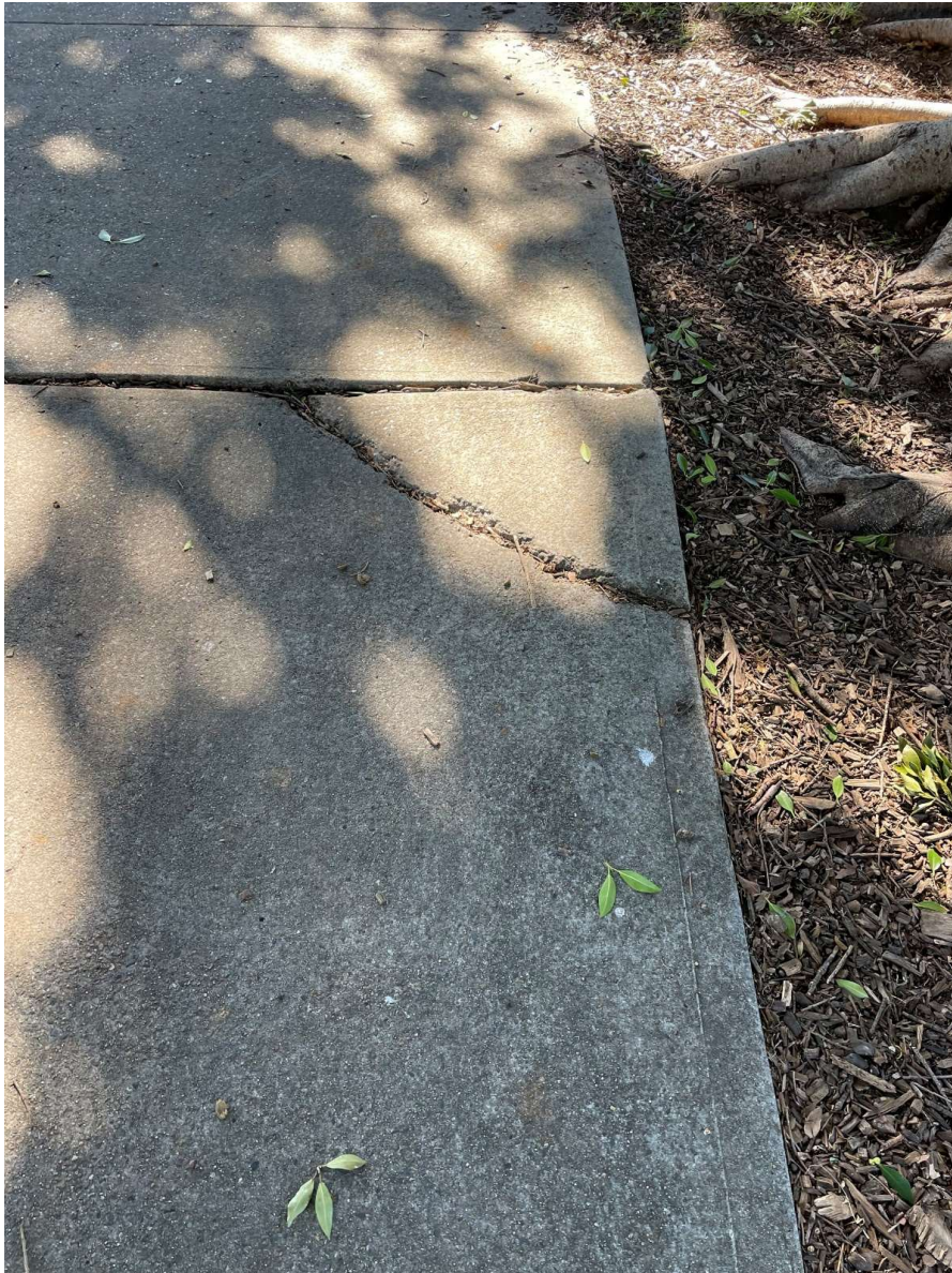
Darvall Street (6)