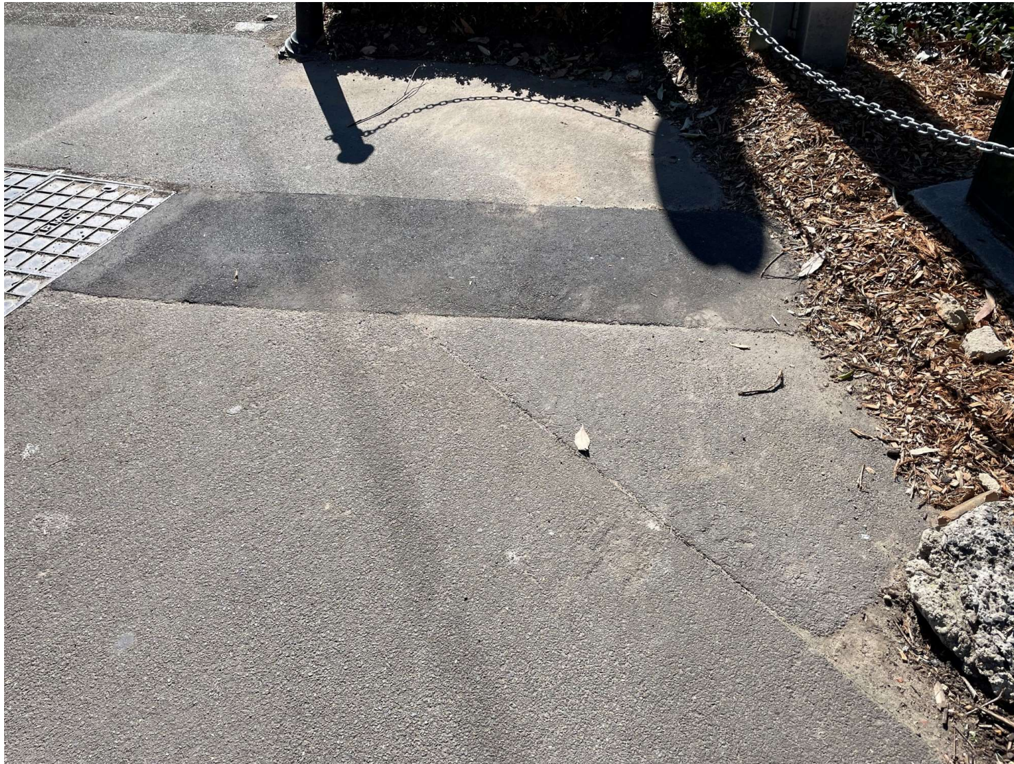
Darling Street (2)