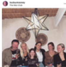
Lawrence Mooney and family during recent Byron Bay holiday.

Triple M breakfast host Lawrence Mooney copped a $1000 fine for breaching NSW lockdown orders after travelling to Byron Bay for a two-week holiday while he was supposed to be locked down in Sydney.