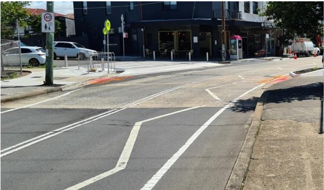
Photo 1 – Southern approach to the proposed temporary pedestrian crossing.