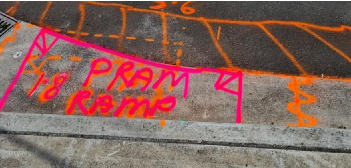
Photo 5 – proposed location of temporary pram ramp at western footpath