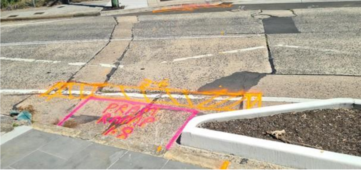
Photo 4 – proposed location of temporary pram ramp at eastern footpath