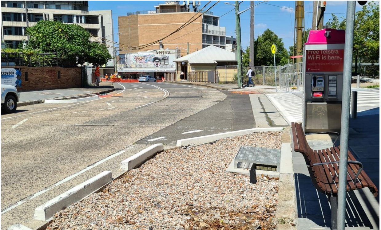
Photo 2 – Northern approach to the proposed temporary pedestrian crossing.