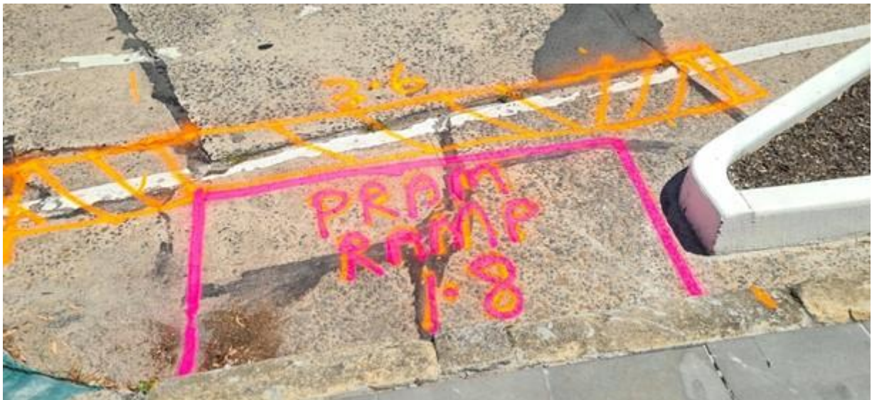
Photo 3 – proposed location of temporary pram ramp at eastern footpath