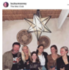
Lawrence Mooney and family during recent Byron Bay holiday.

Triple M breakfast host Lawrence Mooney copped a $1000 fine for breaching NSW lockdown orders after travelling to Byron Bay for a two-week holiday while he was supposed to be locked down in Sydney.